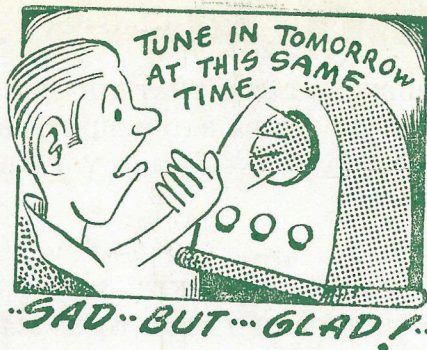
"TUNE IN TOMORROW" $4.50