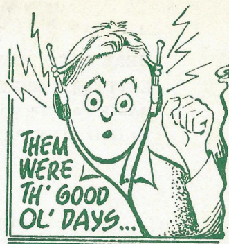
"TH' GOOD OL' DAYS" $4.25